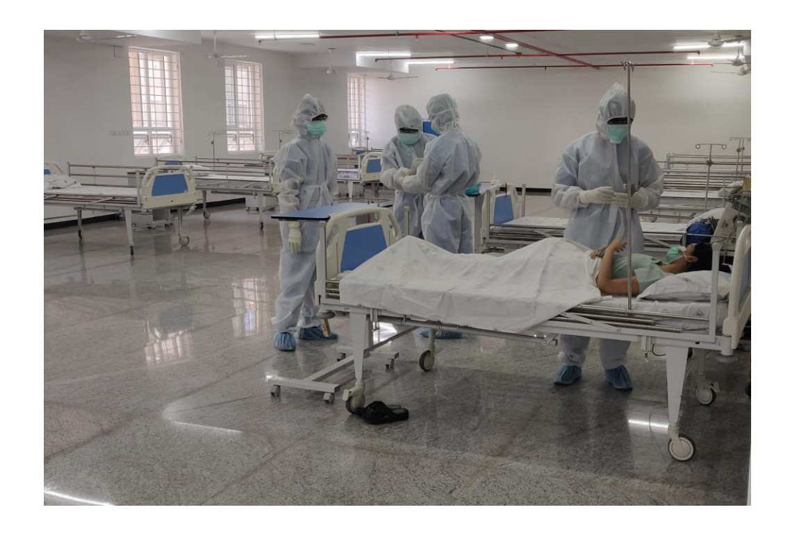
Exclusive COVID Emergency ward