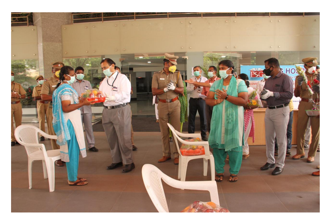
First batch of our COVID patients