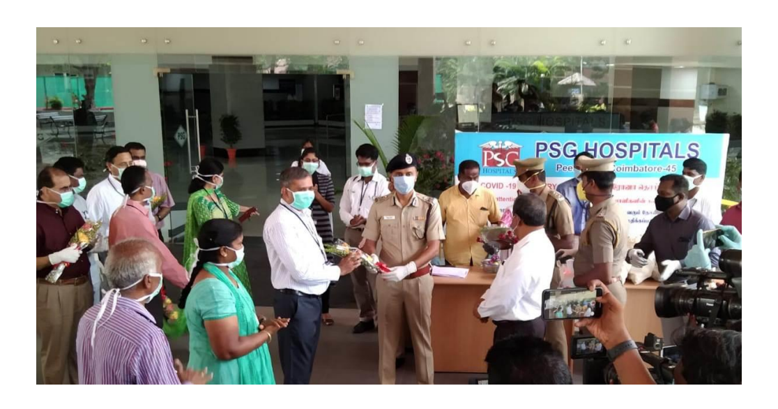
PSG Hospitals felicitated by our Honourable District Collector and The Commissioner of Police.